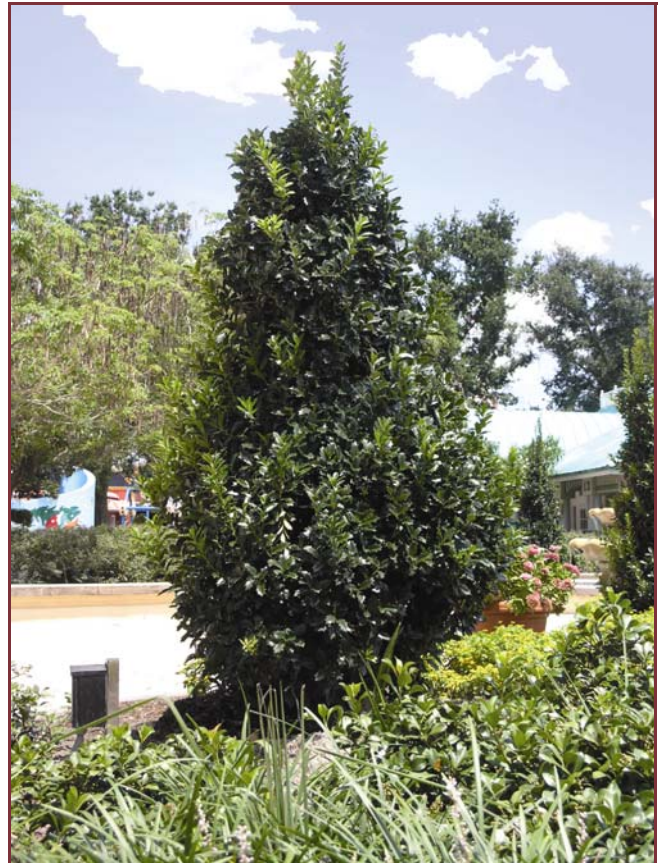
Oak Leaf Holly

Combining eye appeal with great pest resistance and adaptability for multiple environment conditions, the Oak Leaf is an excellent alternative for providing variety for our landscape enjoyment.