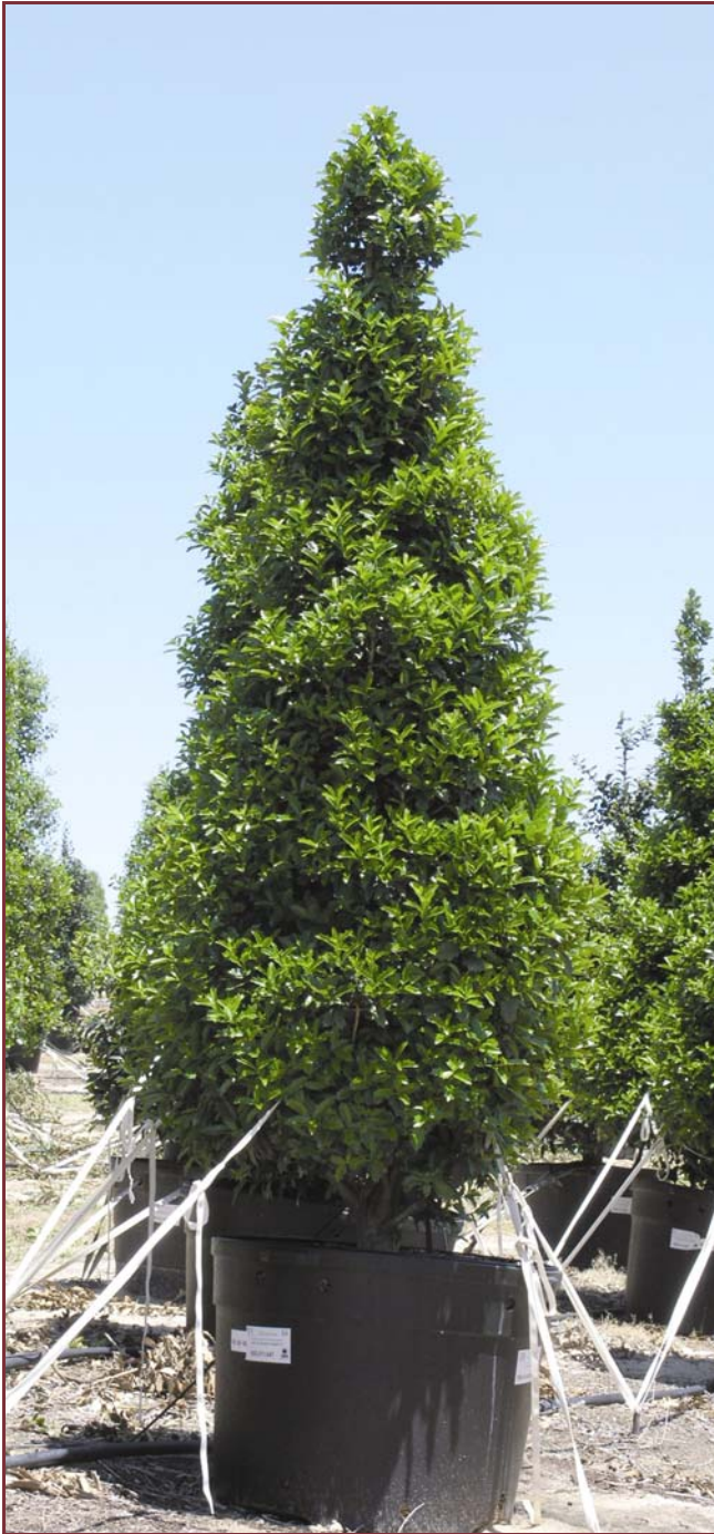
65g Oak Leaf

Ilex hybrida 'Conaf' Oak Leaf P.P.# 9487