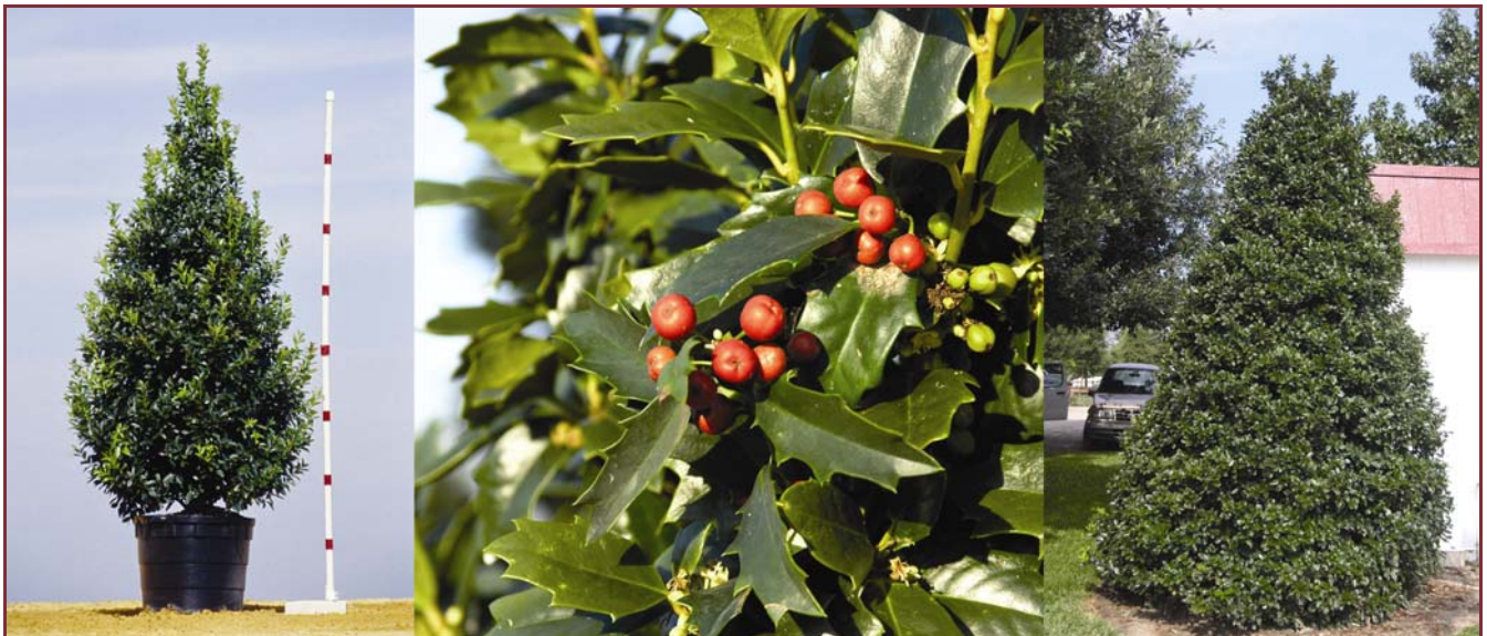
30g Oak Leaf