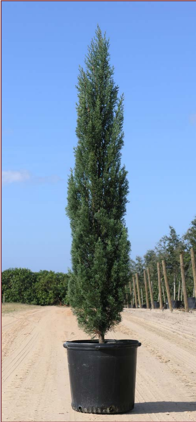
15g Italian Cypress

Native Origin: Southern Europe and Western Asia