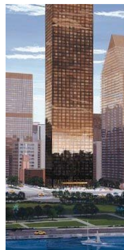
The Trump World Tower at United Nations Plaza in New York City has elegantly landscaped surroundings that add to the splendor of the building.

Trump: Think Like a Billionaire, by Donald J. Trump with Meredith McIver; Random House 2004. Real Estate Section Pages 36, 37