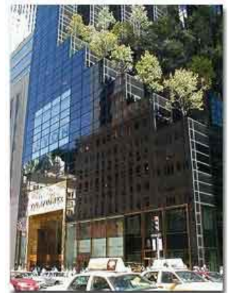
The Trump Tower on Fifth Avenue at 56th Street in New York City has trees planted on each of the “steps” scaling the side of the building.

If you hate physical labor, like I do, you'll hire someone. The trick is finding someone with your taste who can work within your budget and within your schedule. Remember that the cheapest is not always the best. As with contractors, shoddy work will need to be redone or, even worse, corrected, and that can be a disaster. When choosing a landscaper, find a firm with a good reputation by asking your neighbors or other business owners for recommendations.