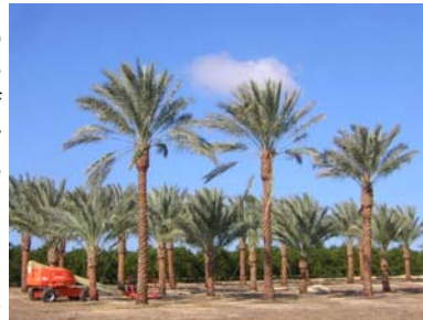
The Medjool Palm holding yard at Cherry Lake Tree Farm has a variety of sizes to choose from.

Cherry Lake Tree Farm has opened its plant pallet, bringing you a variety of palms through the Cherry Select program. The program was designed one and a half years ago to provide you with the convenience and ease of sourcing all of your projects' needs from one place: Cherry Lake.