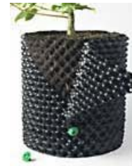
3 gallon Air-Pot container with fully rooted out potting mix.

Cherry Lake has completely converted its production to the Air-Pot. Air-Pots are a proven success at Cherry Lake, allowing us to obtain higher quality trees at a lower cost. Air-Pots are an integral part of our best production practices because, as Alan Heinrich, director of production, says, "You need to start with the roots." Alan even predicts that "air-pruning pots will inevitably become the standard of the landscape nursery industry." ■