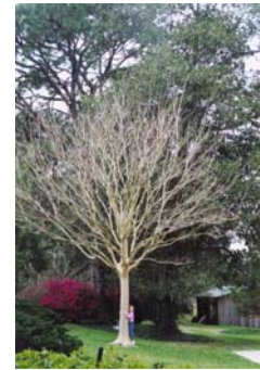
(Above) Mature single trunk 'Tuskegee' near Clermont, Florida. (Below) Close up of the fluted grooves of a 'Tuskegee' trunk.

Grown as a single trunk, 'Tuskegee' will have the largest trunk caliper size of all the USDA National Arboretum selections. The trunk is uniquely characterized by its handsome fluted grooves. 'The single trunk Tuskegee' has been known to grow from 10' height x 2.5" caliper to 25' height x 10" caliper at 18" from the soil line in six years—a proven return on investment and beauty. ■