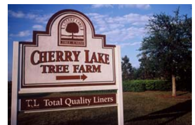
Contact us today to learn more about joining our team.

Process Documentation - Production Quality Assurance/Accounting