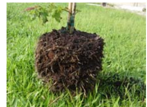
Fibrous root ball of a maple grown in a 3 gallon Air-Pot container.