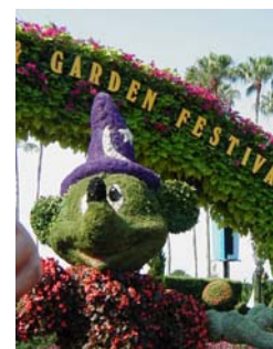
Mickey was among the many Disney characters displayed in topiary form at the Festival.

The 12 th Annual Festival will open on April 15, 2005 and run through June 5, 2005. As good as this festival was, next year's will be even better! ■