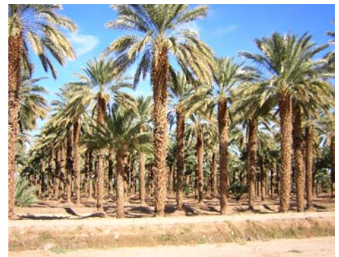
Medjool Date Palm field in Arizona. Medjools are a key element of our Outsourcing Program and compliment our 670g specimens.

'Cherry Select' is our label for outsourced material. This seal of approval certifies that the product was inspected by us and meets our highest standards. Our material is sourced from the highest quality growers in the nation. We have developed privi-